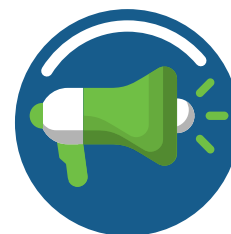
Public awareness campaigns