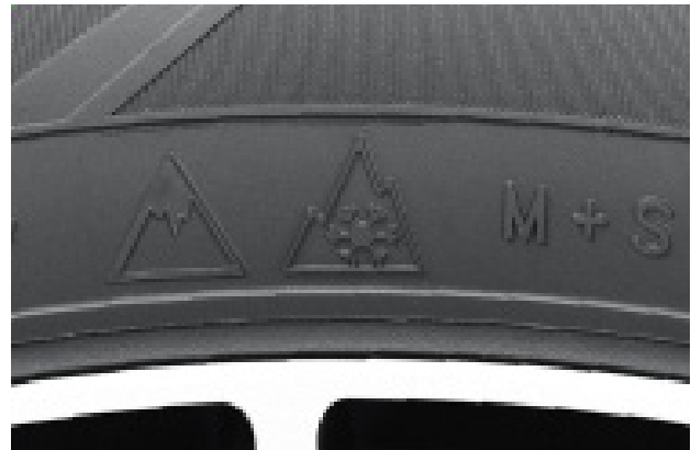
FIGURE 2: Tire sidewall with ice tire, three peak mountain snowflake and M + S symbols.